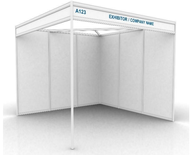
Corner Shell Scheme Stand – 3m-by-3m