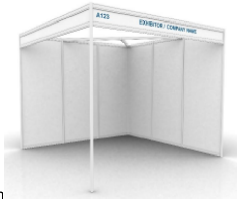
Corner Shell Scheme Stand – 3m-by-3m